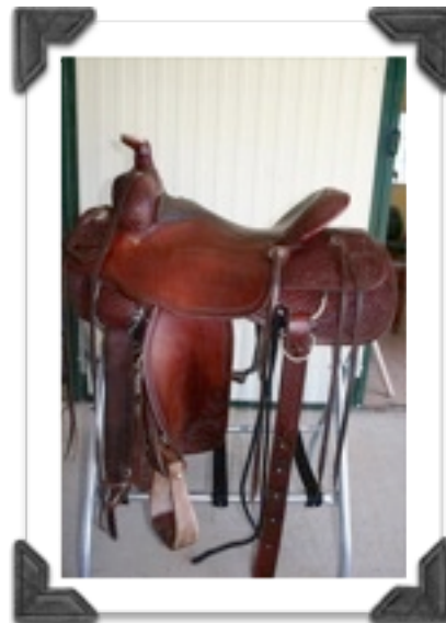
Rocking T ranch saddle. 15" seat. Lightly used, excellent condition. Asking $1500 More photos .