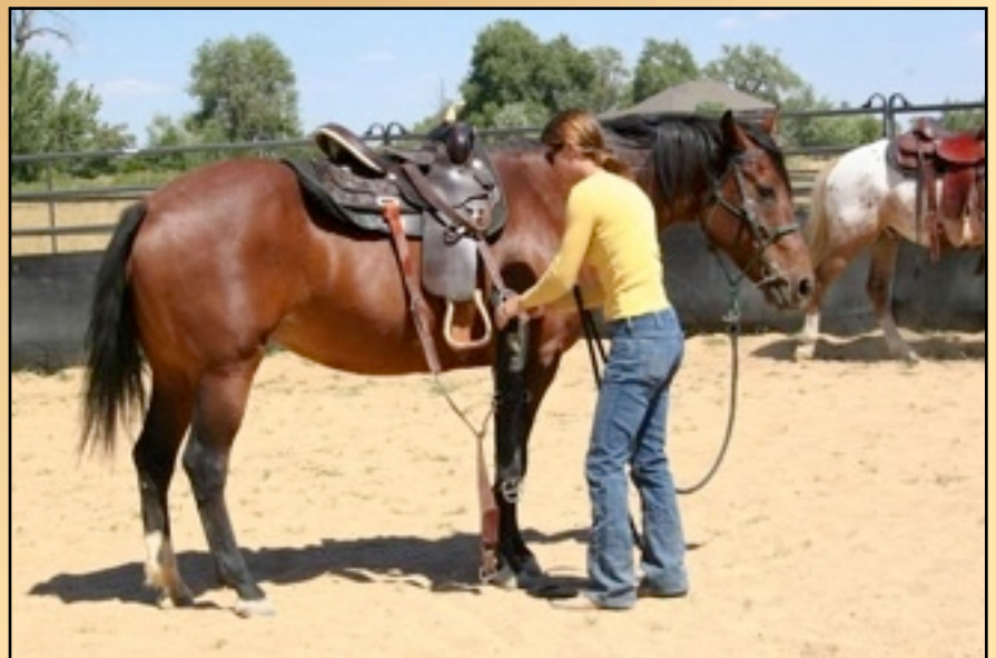
... Colt Starting ...